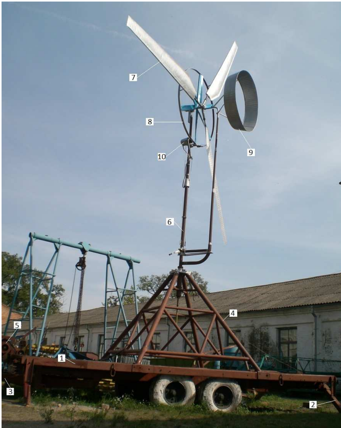
Fig. 3. Experimental model of gearless electromechanical wind energetic wheeled platformed installations: 1 – wheel loader; 2 – swivel bearing; 3 – coupling; 4 – the pyramid base; 5 – liftable mechanism; 6 – swivel stand; 7 – the main blade; 8 – body annular rotor; 9 – tail cone; 10 – generator